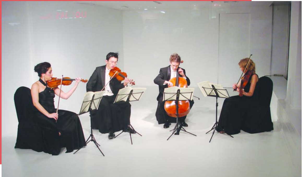
THE IO QUARTET PERFORMING IN A GALLERY OF THE ROGER SMITH HOTEL

http://www.rogersmithnews.com/hotel/video/chambermusic1.htm