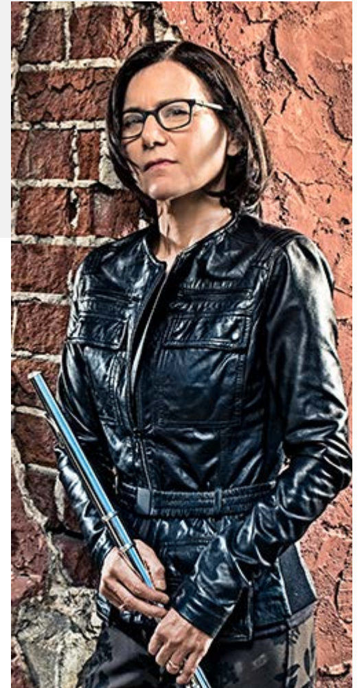
Jamie Baum Flutist-Composer NJW2003